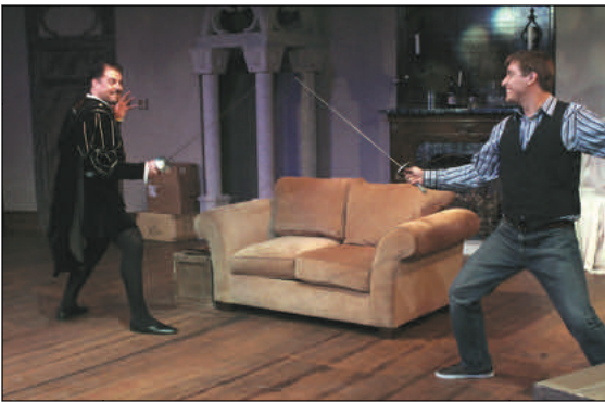
The ghost of John Barrymore confronts a young actor in a scene from I HATE HAMLET at 2nd Space Theatre.